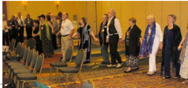
The Circle Will Not Be Broken!