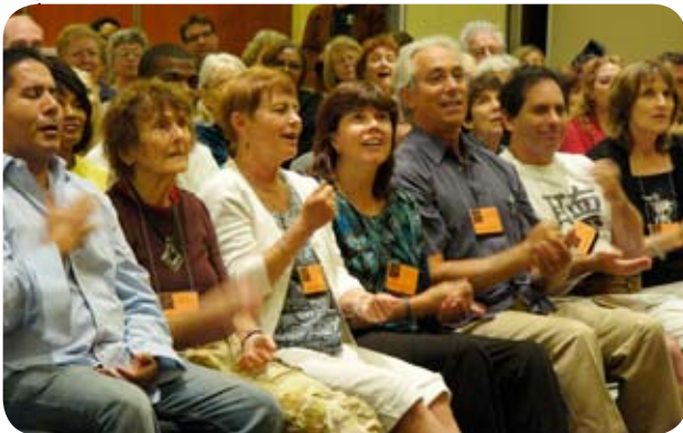
Audience immersed in Victoria Burnett's Black Baptist Church rituals