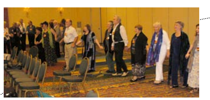
The Circle Will Not Be Broken!