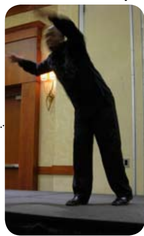
Kirk Waller's Uncle Cleo