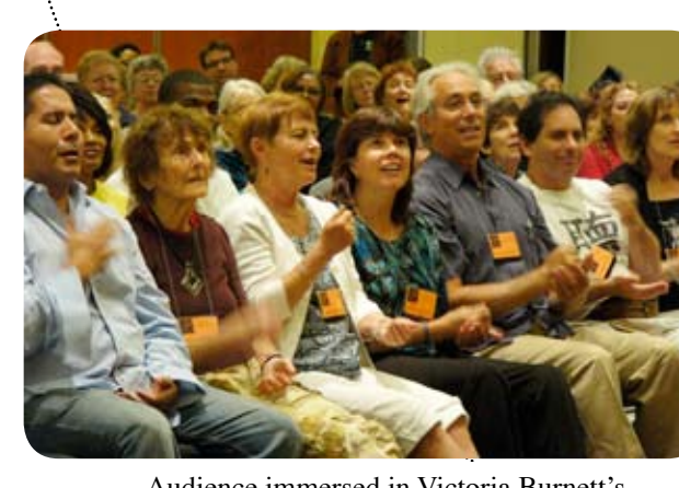
Audience immersed in Victoria Burnett's Black Baptist Church rituals